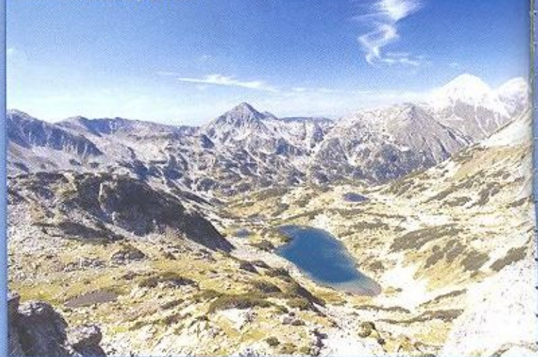
Mountain scenery at Pirin

THE ANSWER: Bulgaria. Bulgaria is already known as a land of ski slopes and mountain trails, but now word is slowly leaking out that Bulgaria is becoming the new place to play golf. Until recently there were only three golf courses in the whole of Bulgaria, but five more are planned and scheduled to open in the next few years. Two of these are also near the top two ski resorts, so ski and golf fans have both hobbies covered.