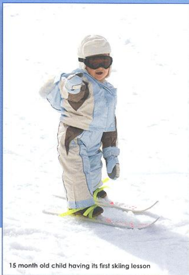
15 month old child having its first skiing lesson

It's true that it is possible to ski and play golf in one day in Spain, but that's where the similarity ends. Apartments and villas in and around these two Bulgarian golf courses and ski resorts are less than a quarter the price of their Spanish counterparts. For example, villas on a Nicklaus course in Spain fetch from STG 400,000 to STG 600,000 compared with similar villas at Dolna Banya which start from as little as STG 88,946 (Euro 130,000), with one bedroom apartments from just STG 37,631 (Euro 55,000). Bulgaria also compares favourably when it comes to weather, with average annual temperatures of 10.5°C, weighed against Spain's 12°C. Bulgaria has over 150 days of sunshine a year, with average summer temperatures of 26°C (79°F) and occasionally climbing to a sizzling 35°C (95°F). Perfect for mum who wants to hit the sun loungers and younger child who wants to dive into an open air pool.